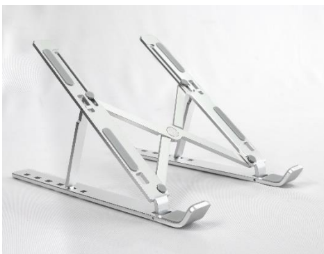
Non-slip silicone pads add stability of tablets on FoldineX, avoid tablets to become scratched and avoid FoldineX to scratch desk.