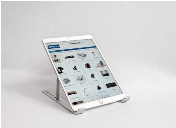
6 screen inclinations selectable